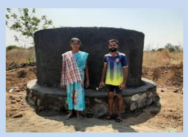
Tank at Penand