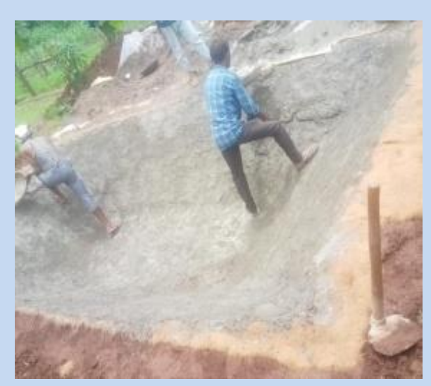
15. Ferrocement Tank 9 feet dia and 4 feet in Height at Hedvi. [Participatory 3] for Velhal from 26th August – Vikas ---